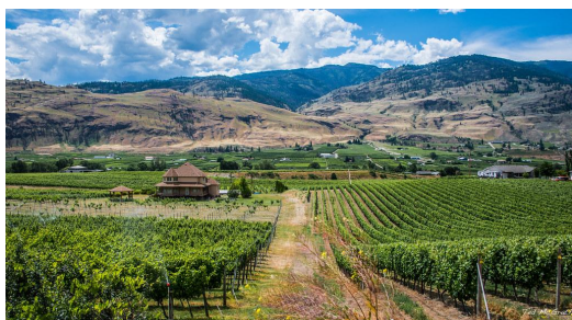
Okanagan Valley orchards above Osoyoos

KELOWNA, BC. Okanagan orchardists predicted a strong apple crop in 1968 after a warm spring and steady summer irrigation, the Kelowna Courier reported. Packing houses along the lake scheduled extra shifts for September, and rail cars were reserved to move fruit to prairie markets. Growers said Spartan and McIntosh blocks showed heavy set, while early varieties already moved to local stands. The paper noted new cold-storage capacity in Winfield would help extend the selling season. Tourism remained brisk along the lakeshore, with motorists stopping at roadside fruit stands on the highway south toward Penticton. Co-op warehouses offered bins and wax paper for smaller growers who still shipped by truck. Agriculture extension officers warned pickers to watch for late-summer heat and to start ladders before dawn when temperatures climbed. Hotel owners in Peachland reported full bookings from visitors touring orchard country before the main harvest rush. Rail officials confirmed refrigerated cars would be staged at Kelowna yard by mid-September. Coldstream growers said irrigation ditches ran full through July without the shortages seen in earlier dry years. Penticton fruit inspectors added weekend shifts to grade early cherries bound for Alberta markets.