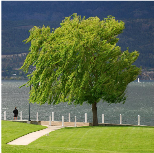
Okanagan lakeshore near Kelowna

VERNON, BC. The Penticton Herald reported that irrigation districts north of Okanagan Lake began lining earthen ditches with concrete in 1962 to reduce water loss during hot summer months. Farmers along the Vernon creek system said the work would help orchards and pasture hold moisture through August. Crews worked in short sections so water could flow to downstream properties each night. The project followed similar upgrades near Kelowna and Summerland. Agricultural officials told the paper that better delivery would support tree fruit expansion without drawing extra water from the main lake outlets. District engineers posted weekly schedules at post offices so irrigators knew when their lateral lines would be shut off. Vernon council approved a small tax levy to match provincial grants for the concrete work. Fruit growers near Coldstream said the lined ditches would protect young trees planted on sloped blocks. District records showed water use dropped eight percent after the first concrete section opened. Orchard foremen said night irrigation runs finished faster once seepage along the old earthen banks stopped. Vernon hardware stores reported steady sales of gate valves and pipe fittings through the summer construction season. Summerland crews shared forms and mix recipes with Vernon teams working the hillside laterals above the lake.